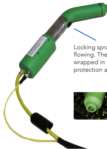
Locking spray trigger keeps the solution flowing. The included 50' foot hose is wrapped in a plastic sheath for added protection and durability.