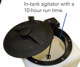
In-tank agitator with a 10-hour run time.