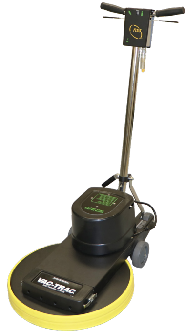
Mustang 1500 with Vac-Trac