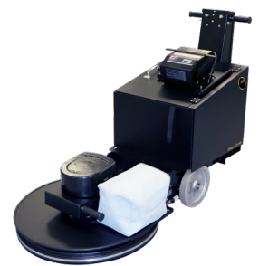
Charger 2717 AB