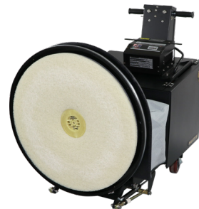
Pad Change Position