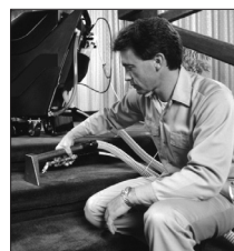
Hand tools and hoses are available for stairs and upholstery.