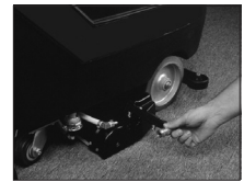
Quick disconnect spray bar slides out easily.