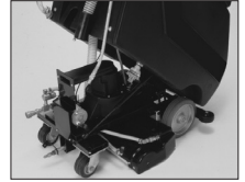
Hinged body allows access to internal components.