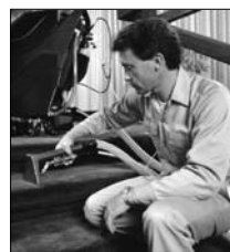
Hand tools and hoses are available for stairs and upholstery.