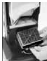
3) HEPA exhaust filter