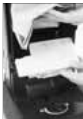
2) Motor filter