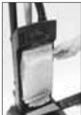
1) Top-filling, poly-lined two-ply paper filter