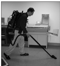
Cordless operation accelerates spot vacuuming in office areas.