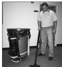
The Outlaw PB can also be mounted on a large barrel. Requires 2 Barrel Hangers (#6990781), 10ft hose (#6990801) and Accessory Skirt (#6990791)