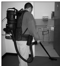
In addition to the enhanced safety benefits of a cordless design, the Outlaw PB's quiet operation makes it ideal for healthcare facilities.