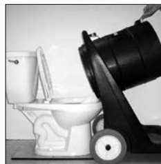
Tip dispose bases empty easily into any drain up to toilet height.

The quiet operation (69 dBA) allows extended use in daytime cleaning environments.